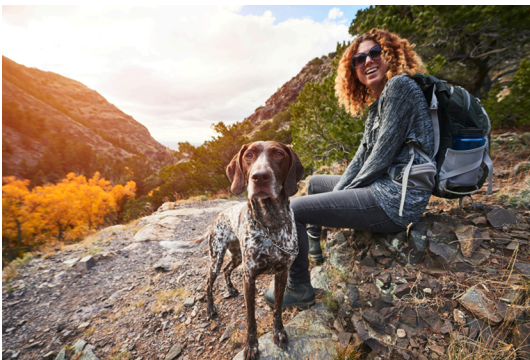
Image classification does not localize the objects in an image or create bounding boxes (as is done in object detection). Example applications of image classification include sorting images into digital albums and processing car images for inventory at an automobile dealership.

Image classification is a central task in computer vision, a subfield of machine learning (ML) and artificial intelligence (AI). Image classification algorithms analyze the pixels of an image and output labels for the entire image. For example, the following image might have the following labels: person, dog, or outdoors.